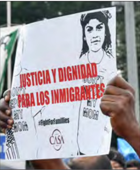
“Justice and Dignity for Immigrants” reads a sign at the rally in D.C.