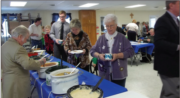
Members of Mt. Zion UMC sample soups as they raise money for the homeless in their community.

FINKSBURG – The Sunday of the Super Bowl is used by many church youth groups to raise funds for local charities of their choosing. The Mt. Zion UMC has a little different take.