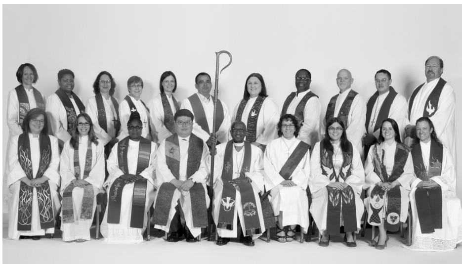
Ordination Class of 2016