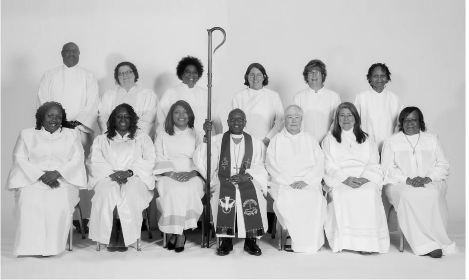
Commissioned Class of 2016