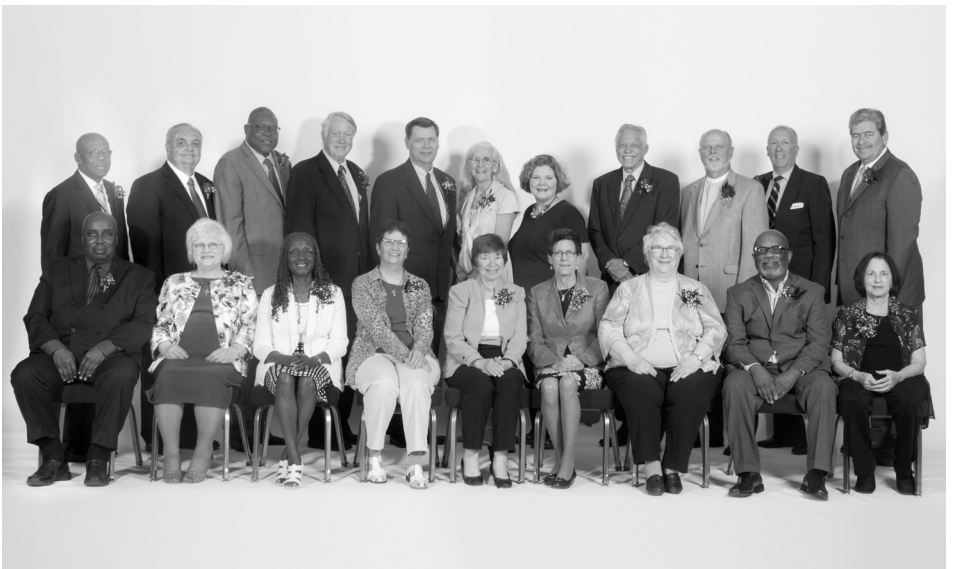
Retirees Class of 2016