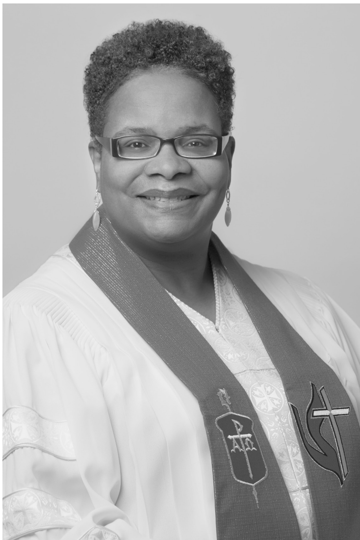
Bishop LaTrelle Easterling Starting September 1, 2016