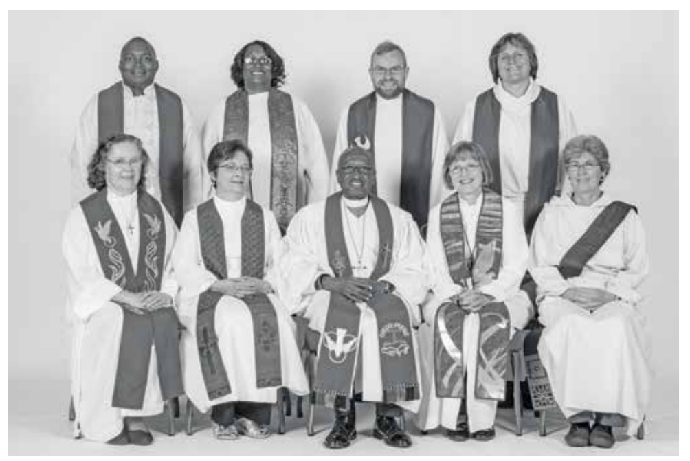
Ordination Class of 2015