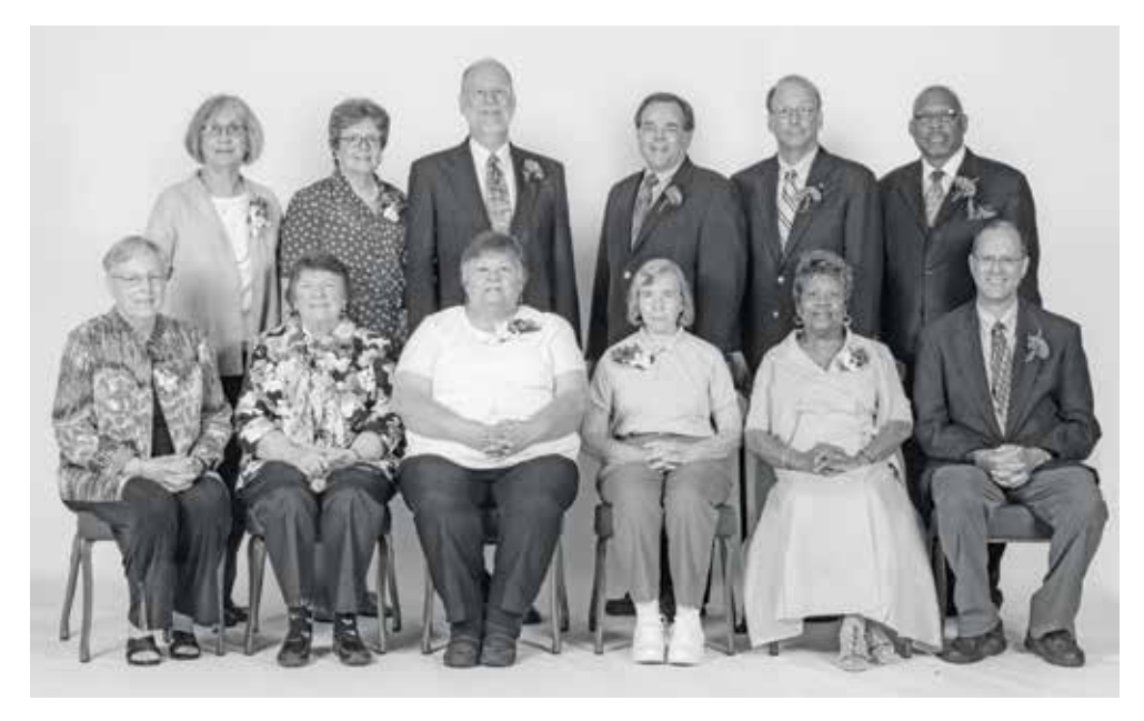
Retirees Class of 2015