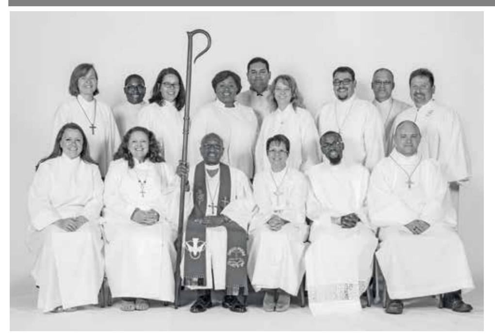
Commissioned Class of 2015