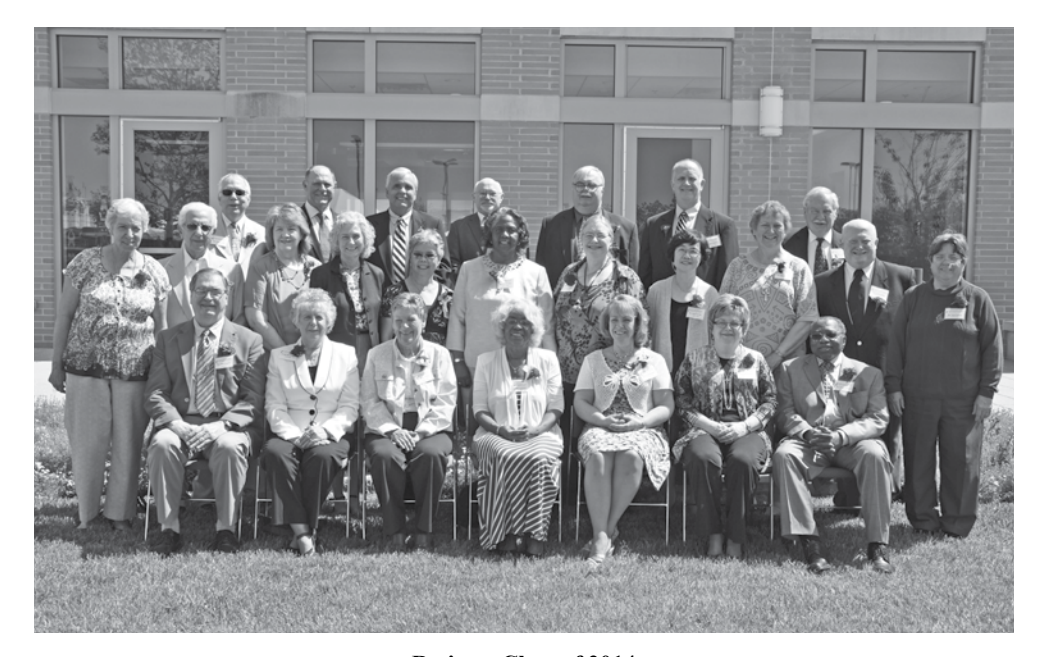
Retirees Class of 2014