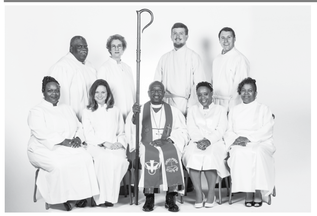
Commissioned Class of 2014