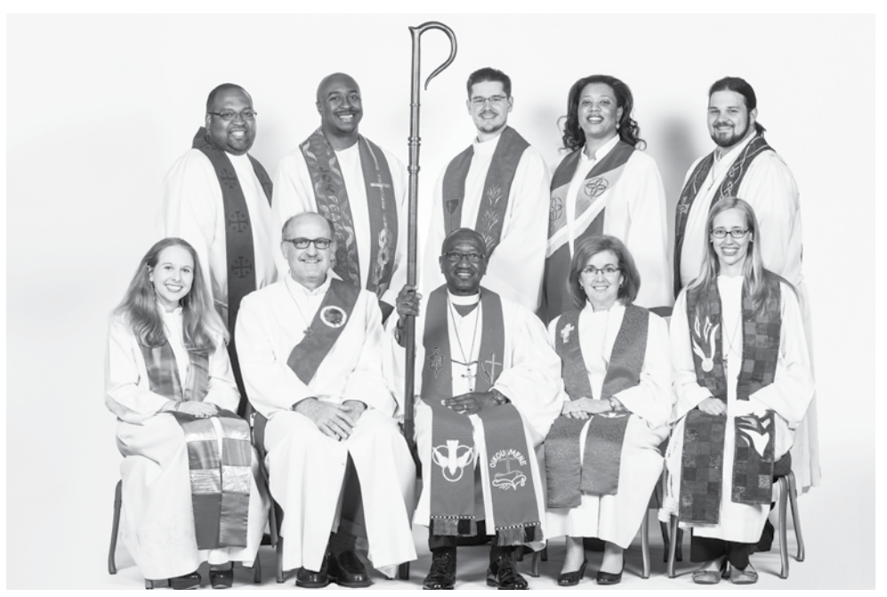
Ordination Class of 2014