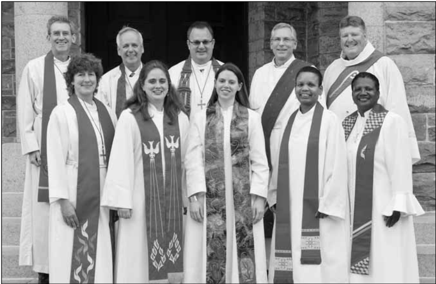
Ordained Class of 2011