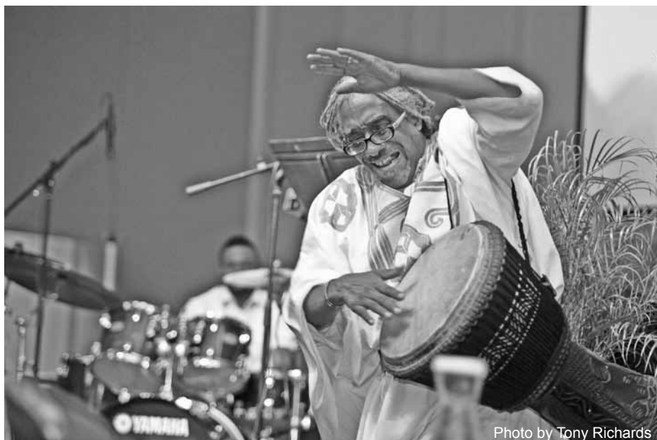
Friday night at Ordination