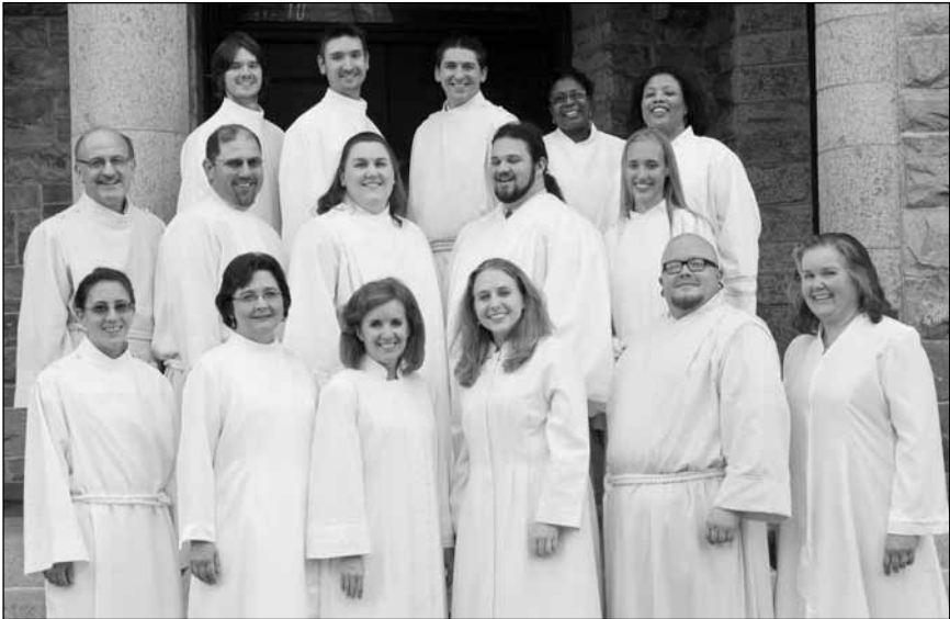
Commissioned class of 2011 - Deacon and Elder Track