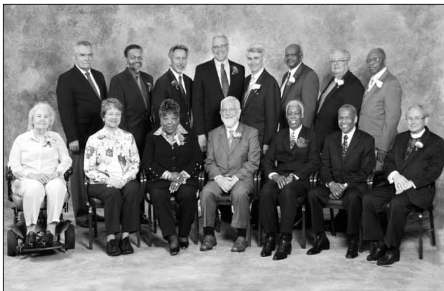
Retirees Class of 2011