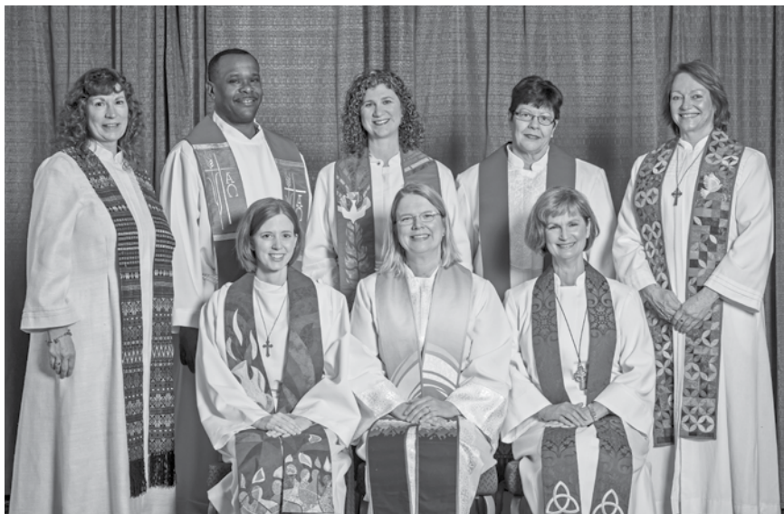
Ordination Class of 2013