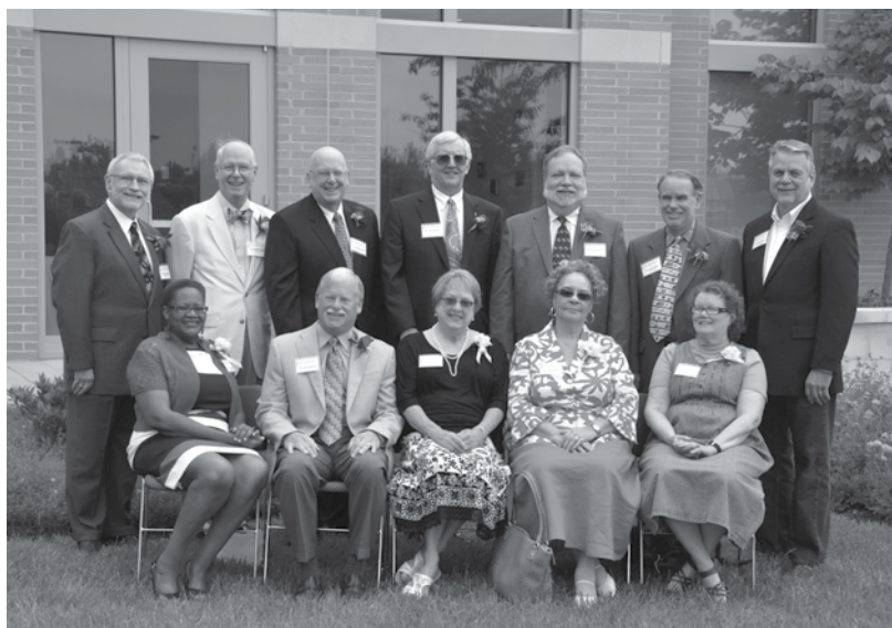
Retirees Class of 2013