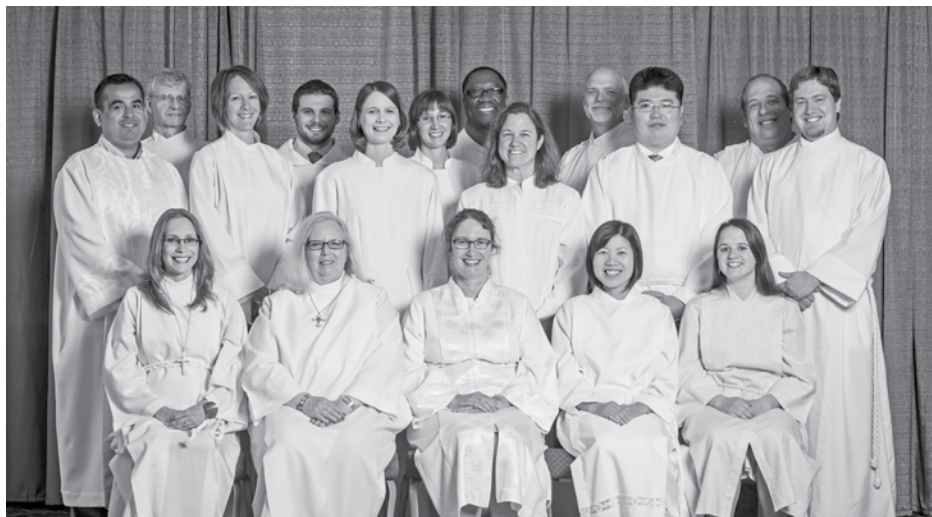
Commissioned Class of 2013